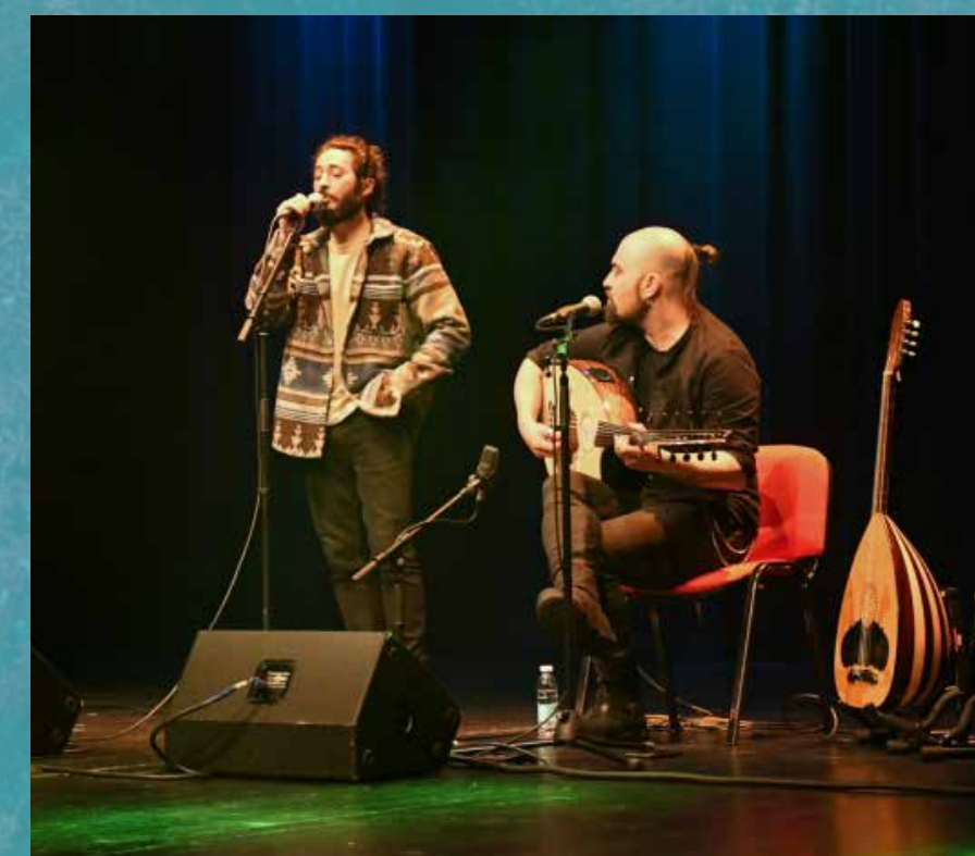
Ensemble Intercultural Part II