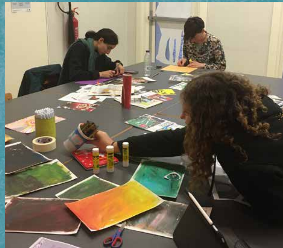
The Art of Integrating