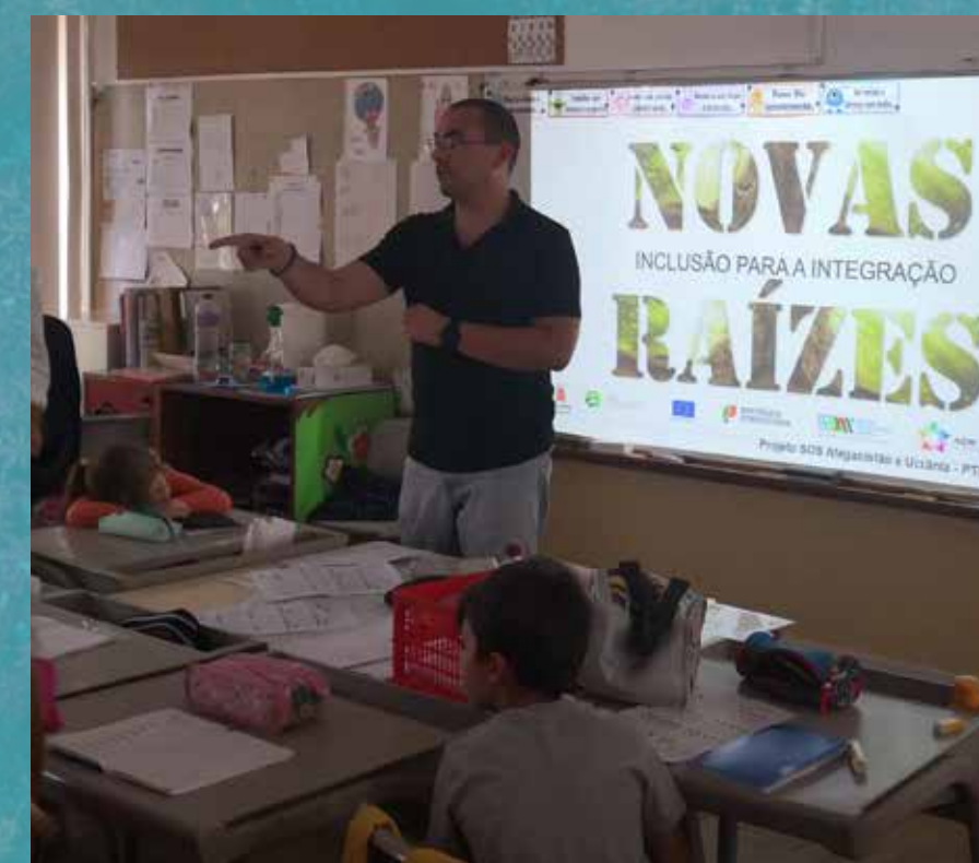
New Roots: Inclusion for Integration