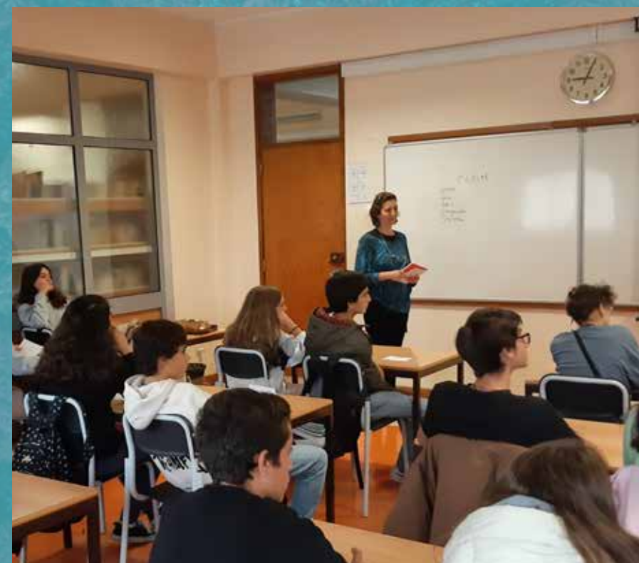
Documentary: Aqui, acolá

To reduce discriminatory behaviour Mediation service devoted to school community