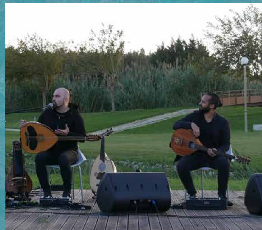
Ensemble Intercultural Part II

To improve migrants knowledge of Portuguese language and facilitate access to resources that empower them