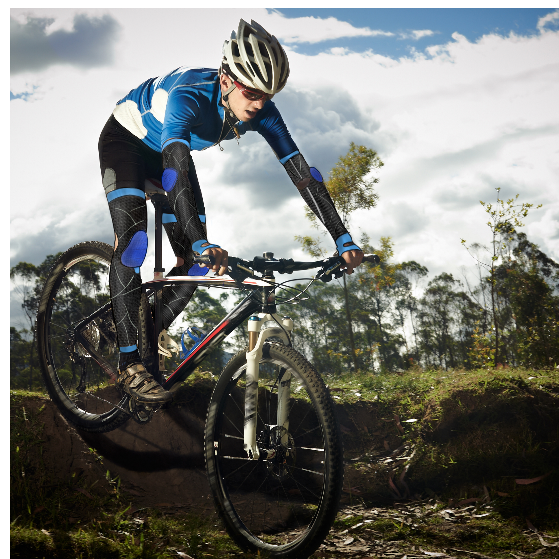
MOBE Hard in action