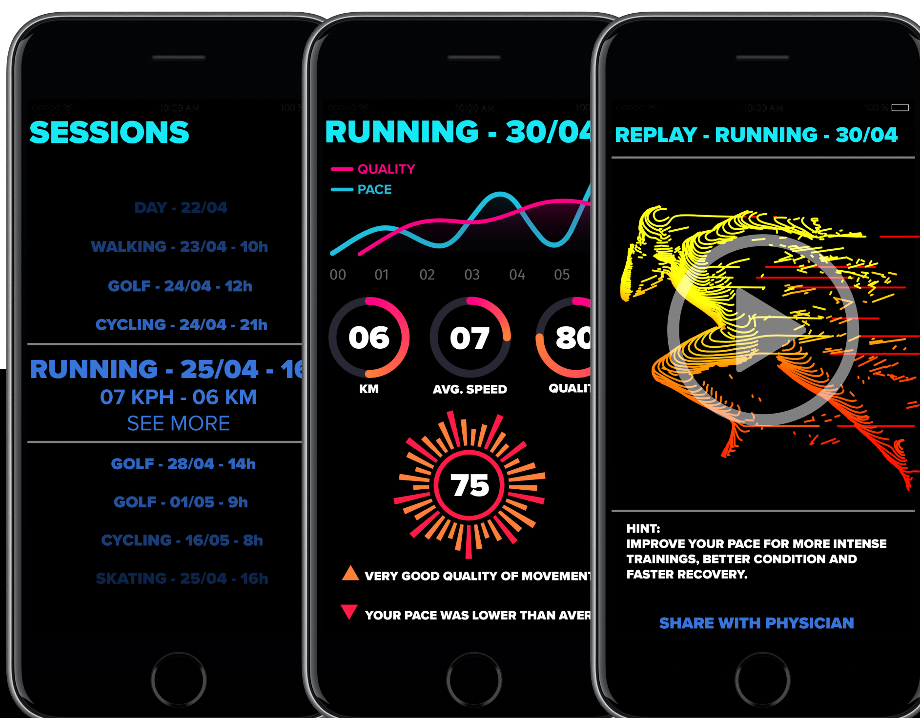
Detailed feedback, tips, replays and more