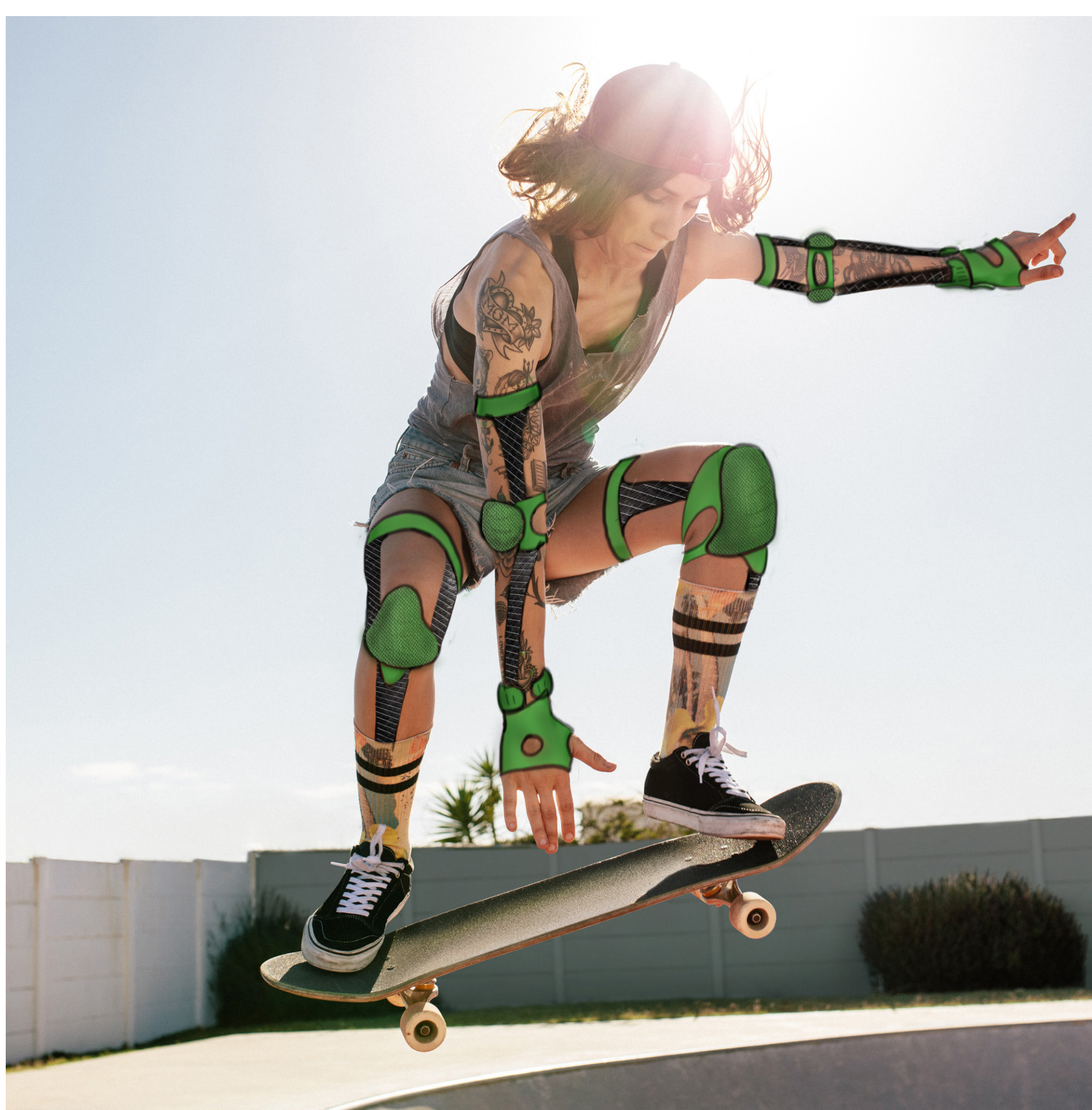
MOBE Medium in action