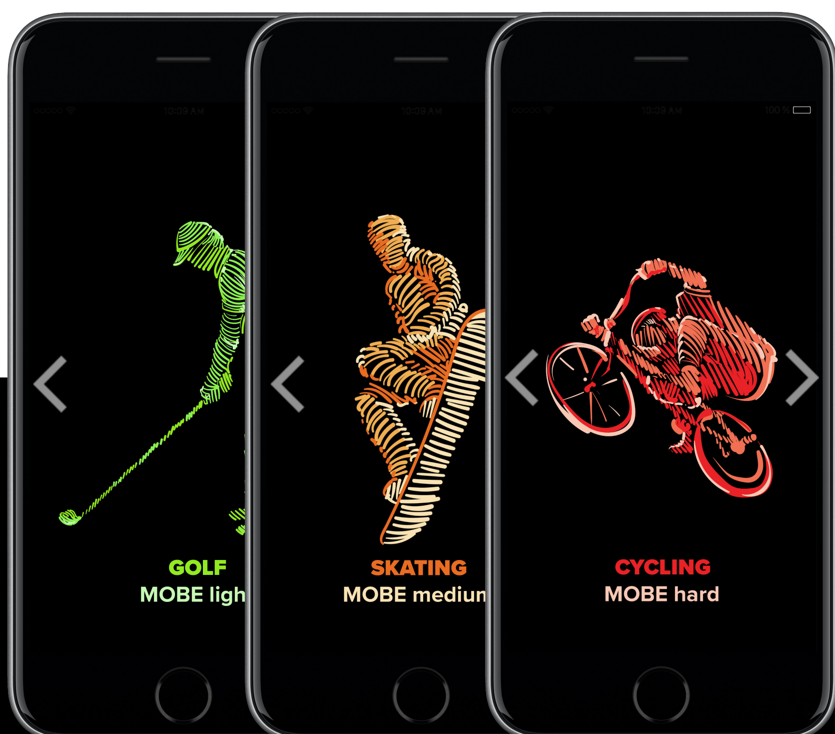
Choose an activity